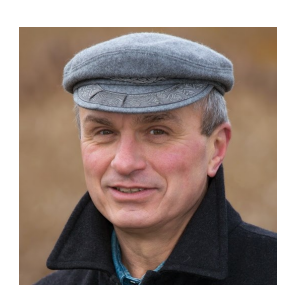
Saturday, April 29th 1:00 PM - 2:30 PM