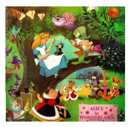
WONDERLAND SCAVENGER HUNT Wed, Sept 4<sup>th</sup> – Mon, Sept 30<sup>th</sup>

Alice has tumbled down the rabbit hole again and landed in the Children's Room!